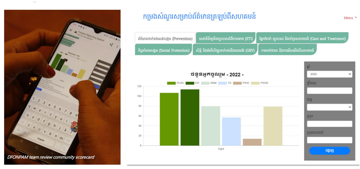
Figure 2, CLM Dashboard with Community Scorecard

The areas being monitored include service delivery, social protection, gender-based violence, prevention, PrEP, care treatment and S+D. Results feed into a dashboard that generates a community score card that is reviewed quarterly by FoNPAM (See Figure 2). Areas for improvement are identified and documented with action points, relevant stakeholders, and status updates.